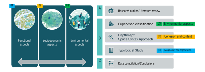
Figure 2. The study's methodological construction

study multi-phase methodological This adopts а framework designed to analyze the complex interplay between green infrastructure, urban morphology, and social cohesion within post-socialist cities, focusing on Budapest's district. Drawing from established urban Ferencváros models—specifically the development principles of Ecology Agency and the LEED the Barcelona Urban Reference Guide for Neighborhood Development-the framework synthesizes ecological urban planning with morphological analysis to address the challenges and potentials urban renewal. of Kev methodologies include Supervised Classification, Space Syntax Analysis, and a Typological Survey (see figure 02).