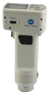
Figure 2. Colorimeter (Internet 1)